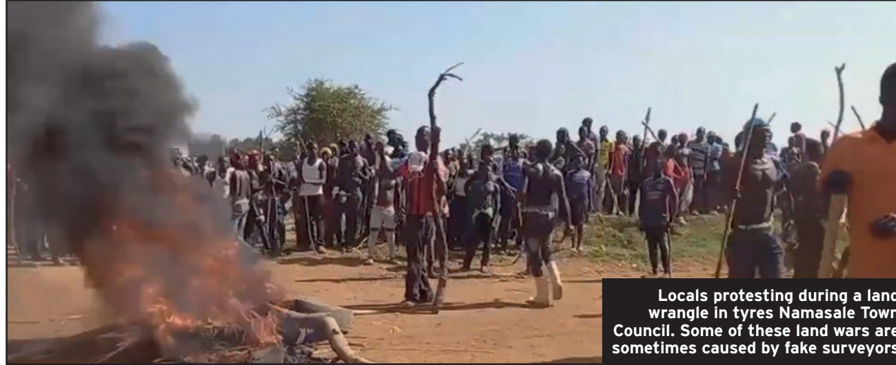
Locals protesting during a land wrangle in tyres Namasale Town Council. Some of these land wars are sometimes caused by fake surveyors

We work with the Institution of Surveyors of Uganda to mentor students and graduates of surveying courses from when they complete their studies